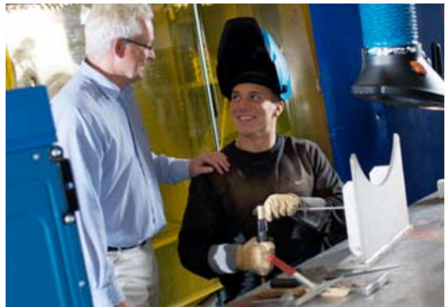
Protection and Safety Courses are frequently arranged at Nederman Educational Centres.